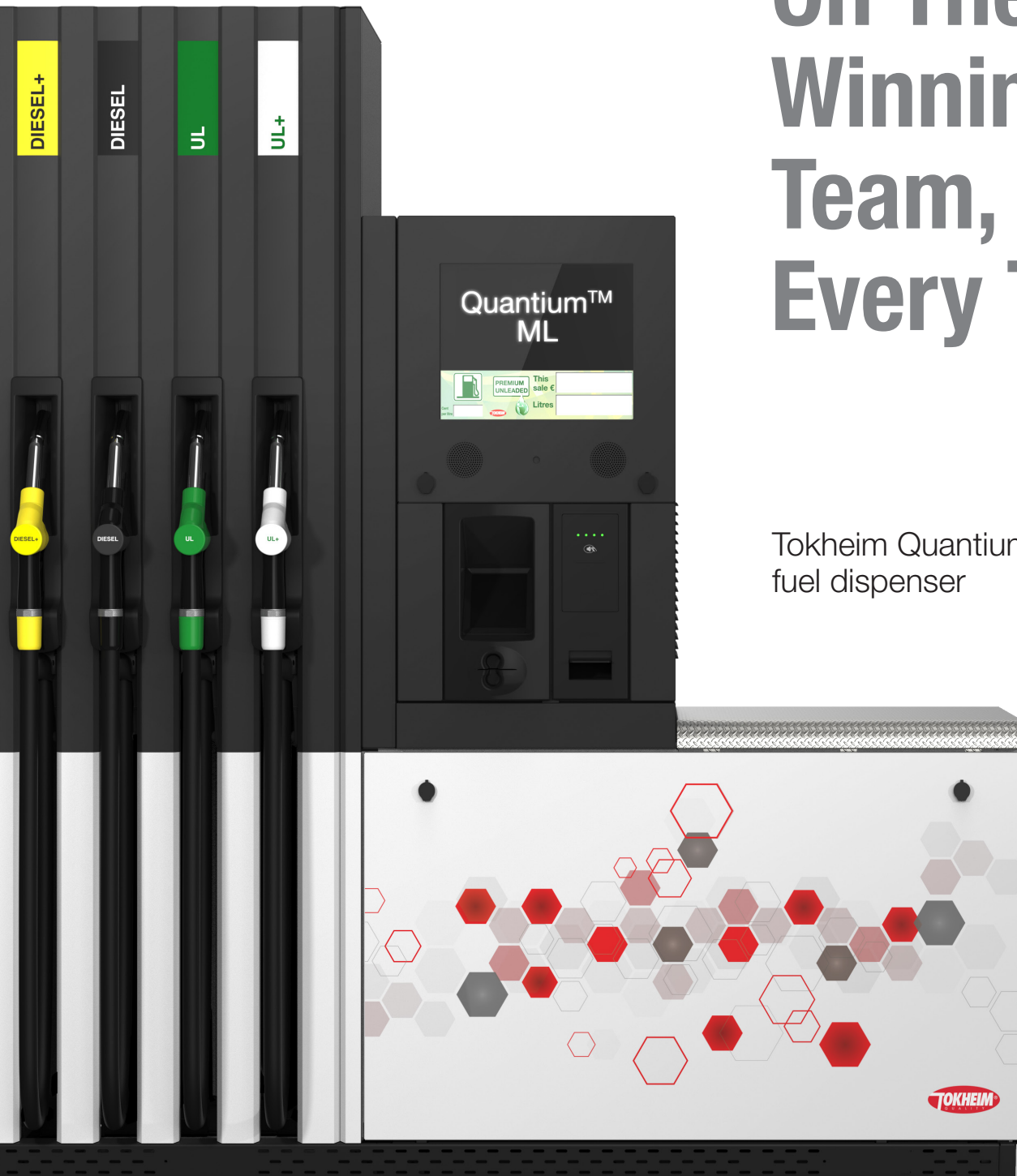
Tokheim Quantum™ ML fuel dispenser